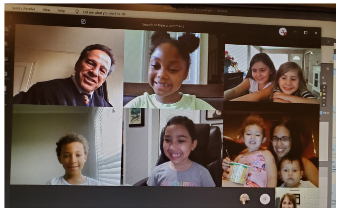
Children of Passaic Vicinage staff enjoy a weekly story time, courtesy of the vicinage's judges.

The program started on June 26 and continued through Sept. 4.