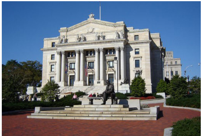
The Essex County Historic Courthouse in Newark as it appears today.

The murals were restored by restoration artists from Japan. Italian stonemasons renovated the courthouse's marble facing. The building was rededicated on Dec. 29, 2004, following a $50 million restoration and renovation project. In 2005, the National Trust for Historic Preservation bestowed its National Preservation Honor Award on the Historic Courthouse.