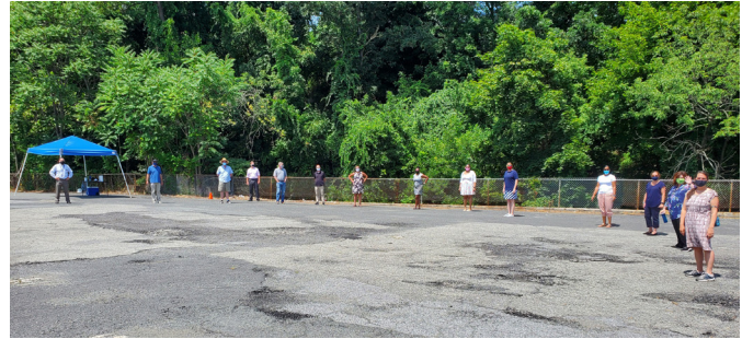
Morris/Sussex Vicinage staff participate in a Privilege Walk to raise awareness of implicit bias.

Participants wore masks and stood in a straight line at least six feet apart. A series of statements were read and if a participant could identify with a statement, they were asked to step forward. The questions focused on areas of privilege such as race, gender, religion, education, socio-economic status, sexual orientation and being able-bodied. The exercise helped to visually display that the more steps a participant could take forward, the more privileges they experience. Such privileges are not always noticeable and often are taken for granted.