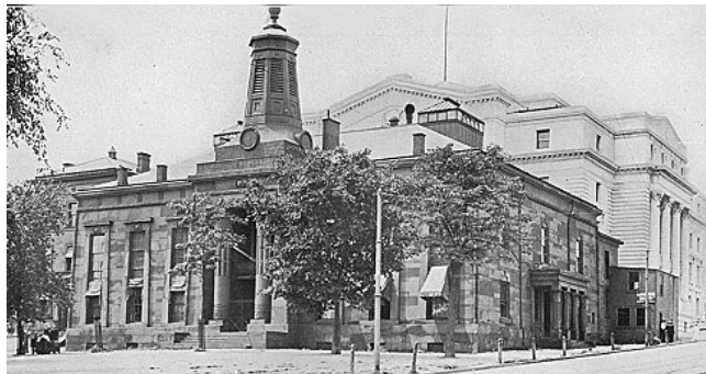
The original Essex County Courthouse was built in 1837. It was demolished in 1906.

Designed by Cass Gilbert, who designed the U.S. Supreme Court building.